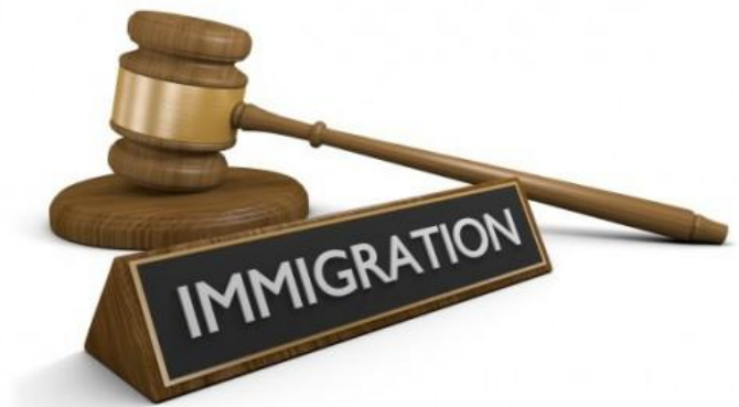
Graduate student film: undocumented ‘deserve’ to be in US, rips Trump immigration policies